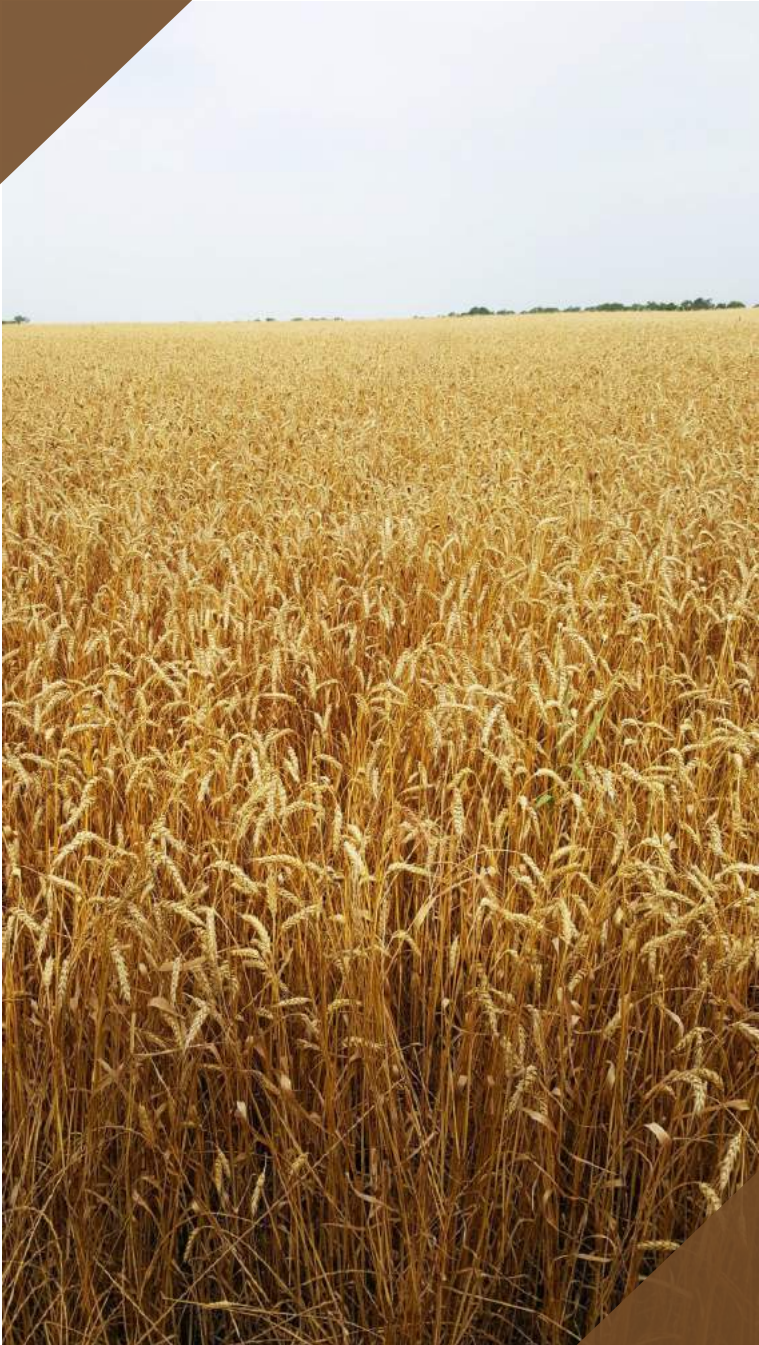
Pictured: Tack & Ag's 2017 crop, just north of Greenville, Texas.